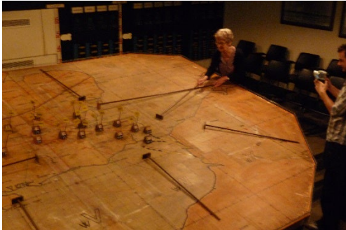
Kay WWII 85 th anniversary: Kay at the map table in 'The Bunker' at RAF Uxbridge