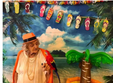
A Surbiton resident gets into the Caribbean spirit