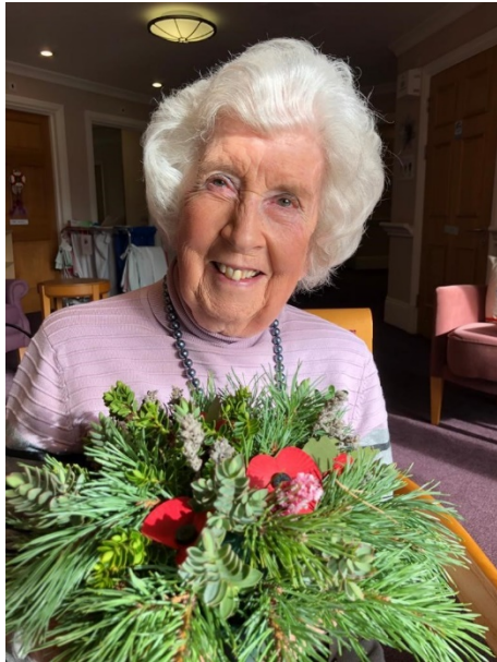
Solihull Remembrance Activity 1: A resident with a home-made poppy wreath