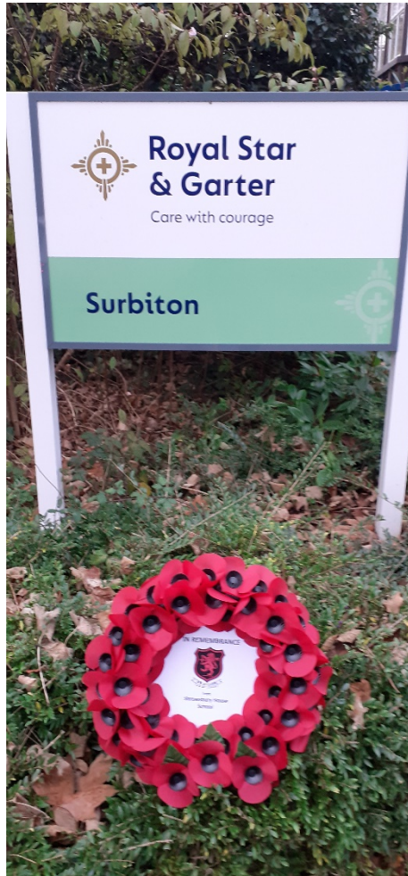
SHS Wreath: The wreath left by Shrewsbury House School at Royal Star & Garter Surbiton