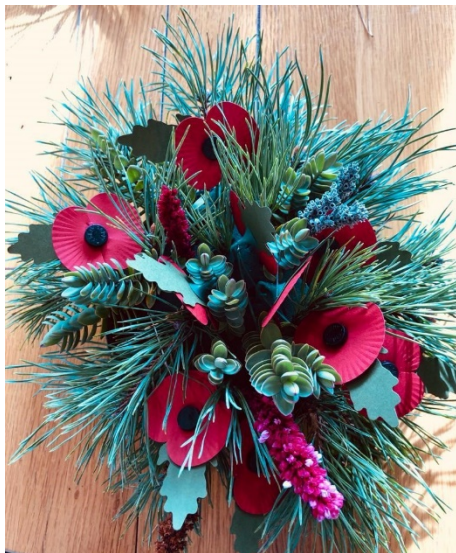
Solihull Remembrance Activity 2: One of the poppy wreaths made by residents at the Solihull Home