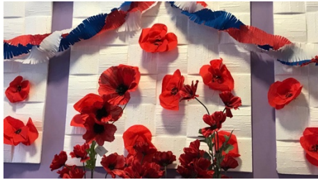
A poppy display, made by residents, at Surbiton

On Remembrance Sunday (8 November), veterans watched the annual service at the Cenotaph on TV. The charity was unable to have residents or representatives at this year's service due to COVID-19 restrictions.