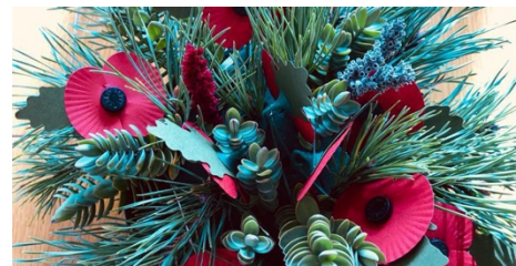
One of the poppy wreaths made by residents at the Solihull Home

At High Wycombe, residents laid poppies and wreaths they had made in the Home's Remembrance Garden, ahead of their Armistice Day service.