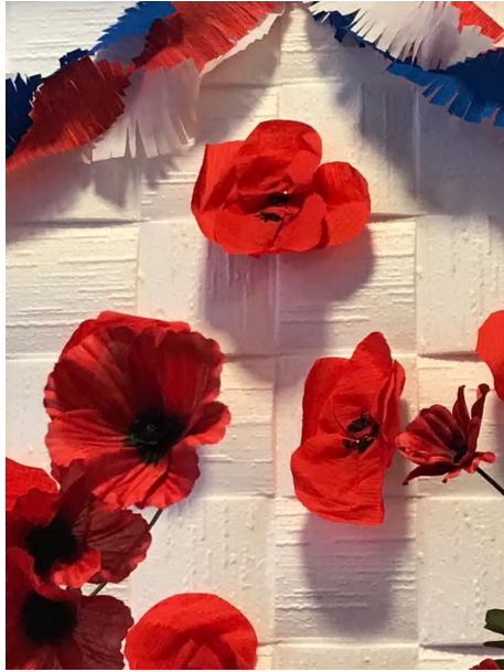
Surbiton Activities 1-5: Veterans made poppies at the Surbiton Home