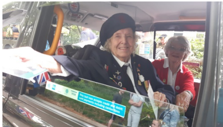
The Taxi Charity for Military Veterans took veterans to the Liberation Day services in the Netherlands