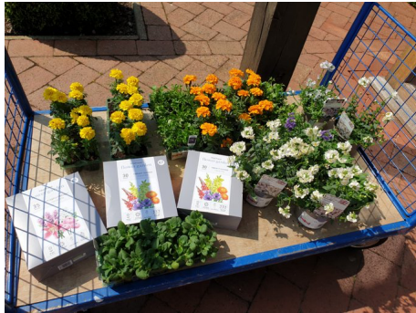
Waitrose in Solihull has been providing welcomed donations to the Home, including these flowers

Hand soap and Personal Protective Equipment (PPE) have also been donated to the Homes from local groups and schools, including Pipers Corner School, which gave neighbouring High Wycombe Home 40 face shields.