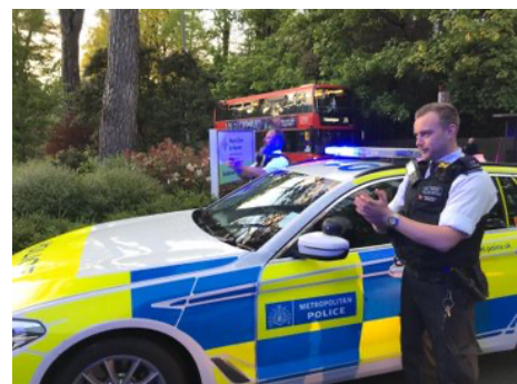
Kingston police clap staff at the Surbiton Home during one of the Thursday night claps for NHS staff and key workers

In April, Kingston police showed their support by visiting the Surbiton Home to take part in the weekly clap for NHS staff and key workers.