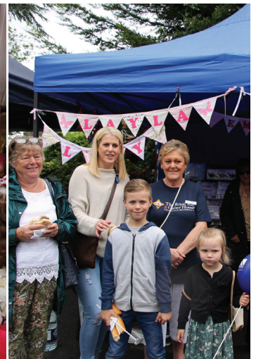
Families enjoying the stalls