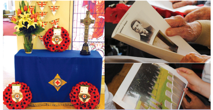
Commemorations for The Battle of the Somme