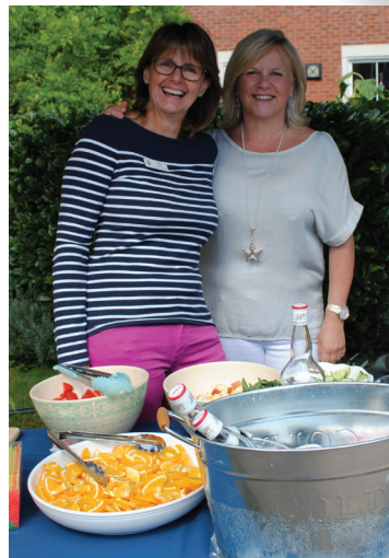
Pimms and smiles

Both the Solihull and Surbiton Homes welcomed the local communities to our colourful Summer Fetes. Despite the British weather, the crowds were eager to join in the fun. We are grateful to everyone who supported these events and especially to Probate Solicitors Ltd in Solihull and CHK Mountford Lettings Agents in Surbiton for their generous sponsorship.