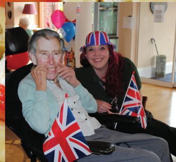
A royal visitor at Solihull