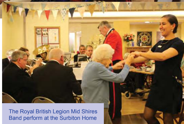
The Royal British Legion Mid Shires Band perform at the Surbiton Home