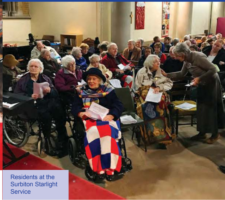
Residents at the Surbiton Starlight Service

The class was run by Hartbeeps, as part of an ongoing partnership between the Solihull Home and the local group to help bring generations together. Classes have proven to be a huge success with residents, who enjoy the youthful fun and energy of the children.