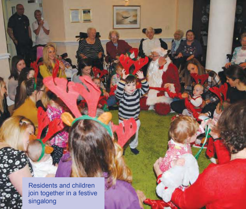
Residents and children join together in a festive singalong