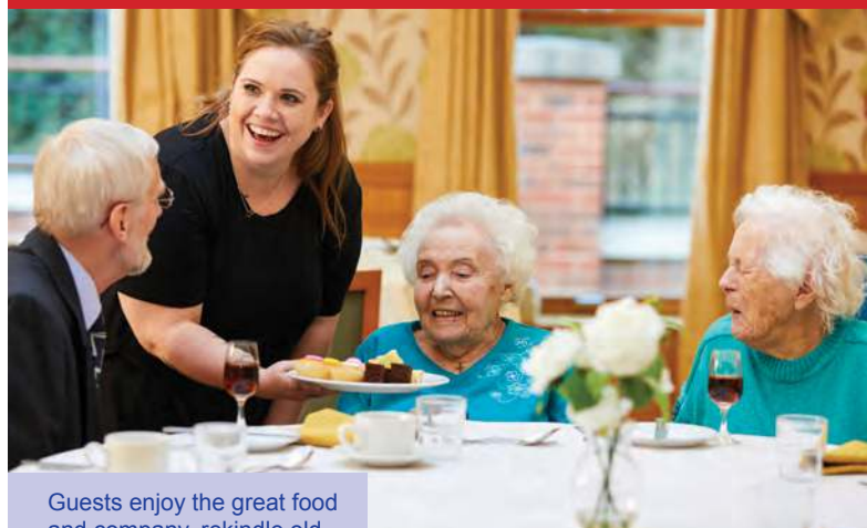
Guests enjoy the great food and company, rekindle old talents or learn new skills

We are delighted to hear that Solihull are trialling a new day care service in the community and that access to a dedicated activities room has made the trial possible. I wish the Star & Garter Club every success. We are delighted to see our grant reaching even more veterans.