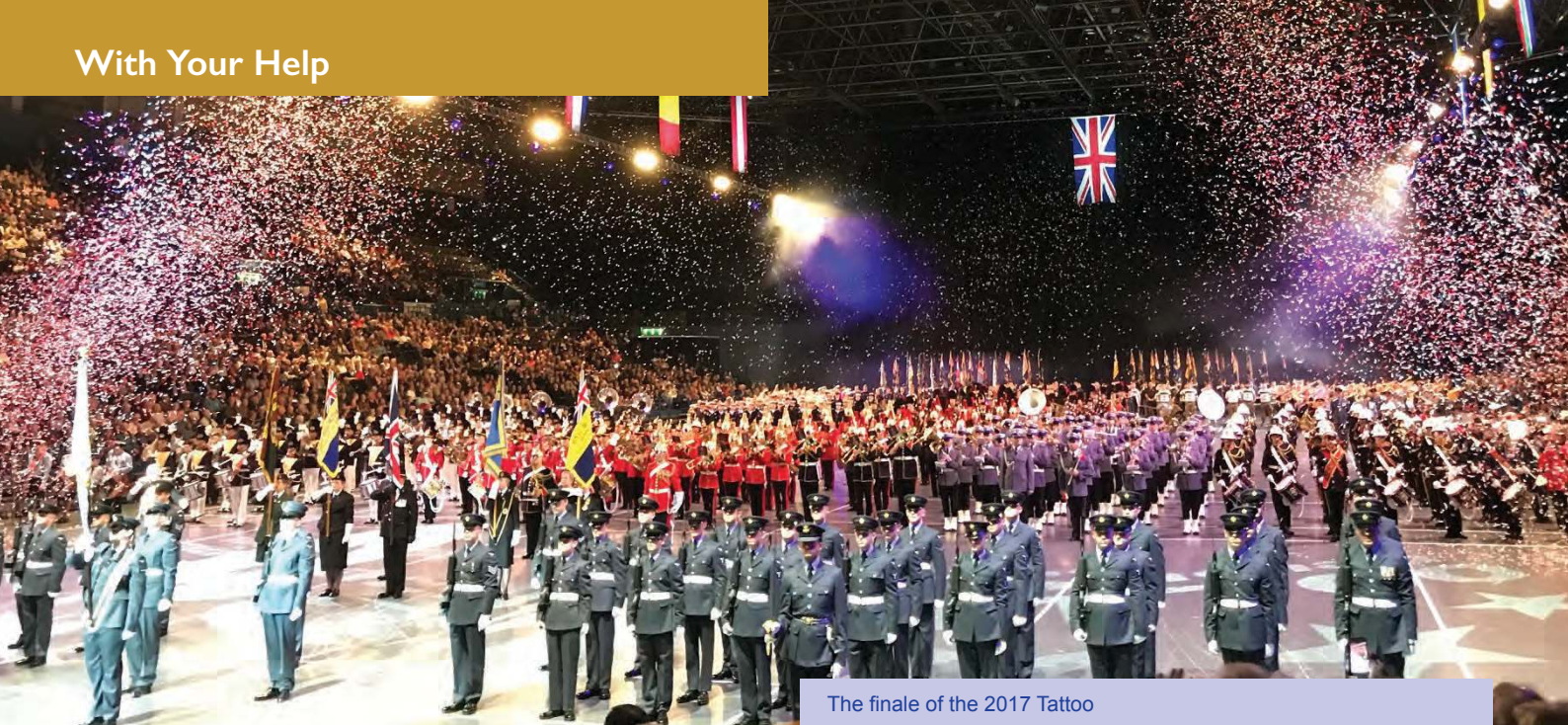
The finale of the 2017 Tattoo