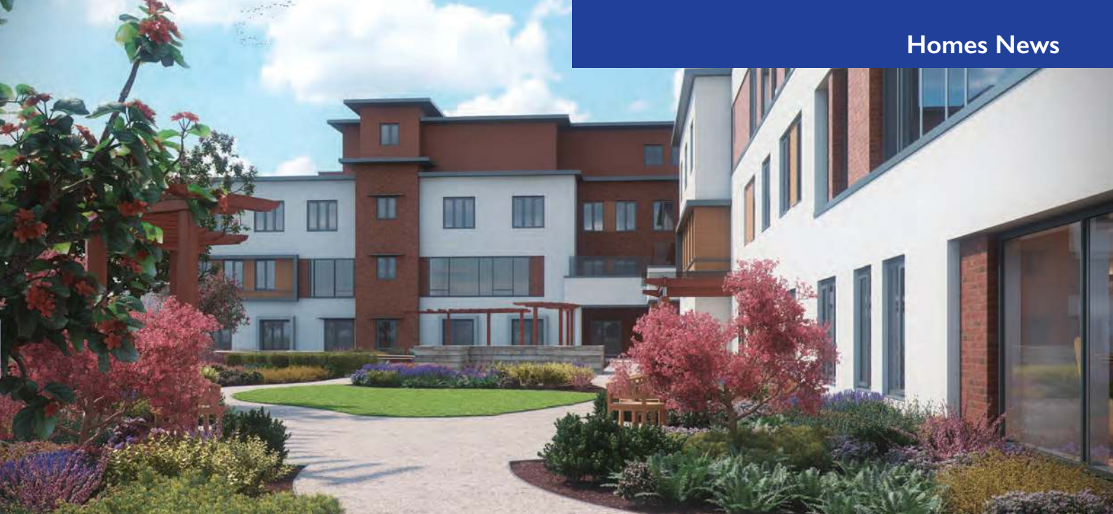
An artist's impression of how the High Wycombe Home will look (above) and the building at present (below)