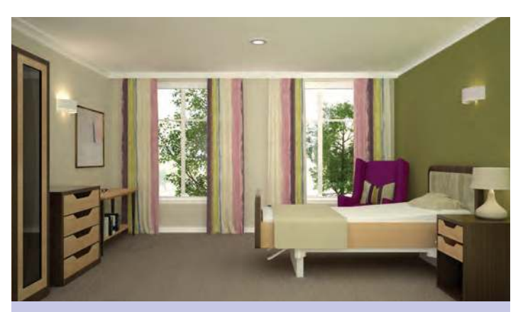
Artist's impression of a Dementia Care Bedroom

The team at Park Grove Design feel honoured to be working on behalf of men, women and their partners who have committed part of their lives to the safety of others. We also very much appreciate that the Star & Garter team are committed to quality and to innovation!