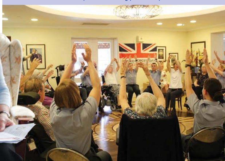
Residents and RAF Halton personnel taking part in adapted Tai Chi