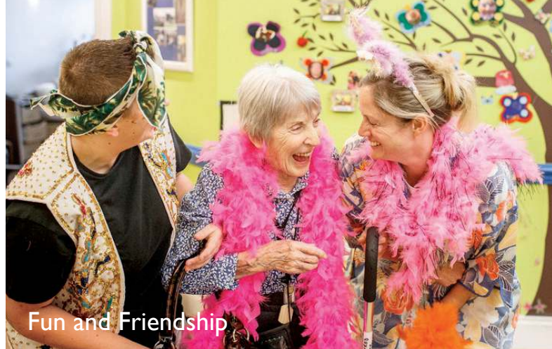
Fun and Friendship

The Charity's ethos of providing exceptional care remains at the heart of everything we do. This life-enhancing care is only possible with the help of our supporters and gifts in