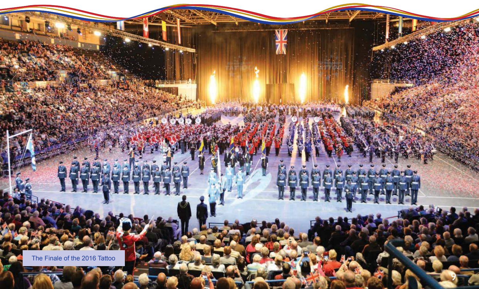
The Finale of the 2016 Tattoo

For more information and to book tickets visit: www.birminghamtattoo.co.uk