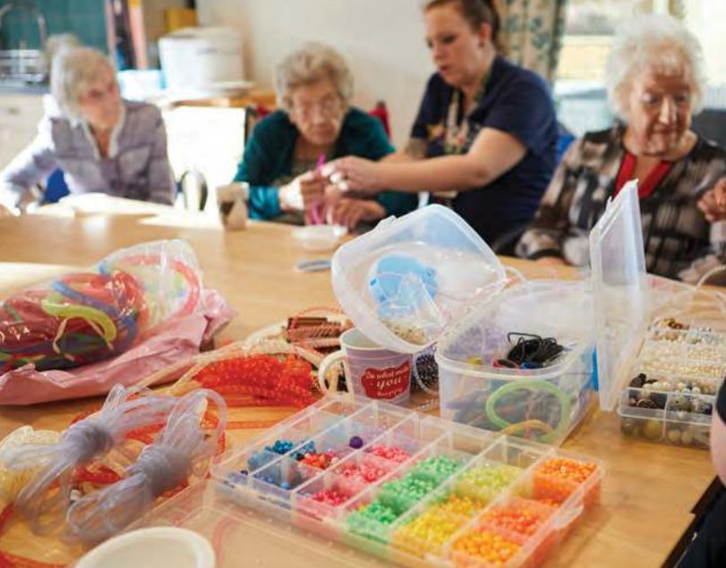
The new activities area is enjoyed by all of our residents and day care guests