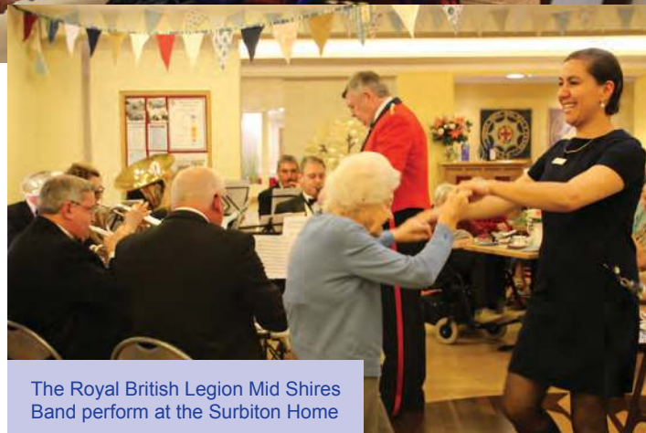
The Royal British Legion Mid Shires Band perform at the Surbiton Home

The Princess has a long-standing relationship with The Royal Star & Garter Homes, after becoming the Charity's president in July 1964. Since then Her Royal Highness has visited the Homes on many occasions, always devoting much of her time to getting to know residents.