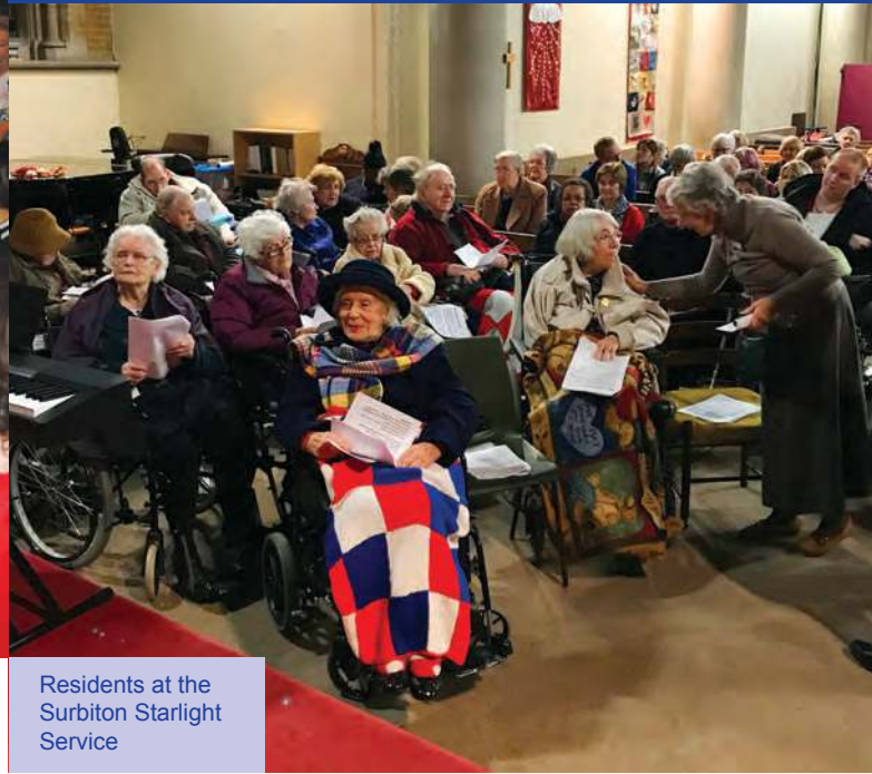
Residents at the Surbiton Starlight Service