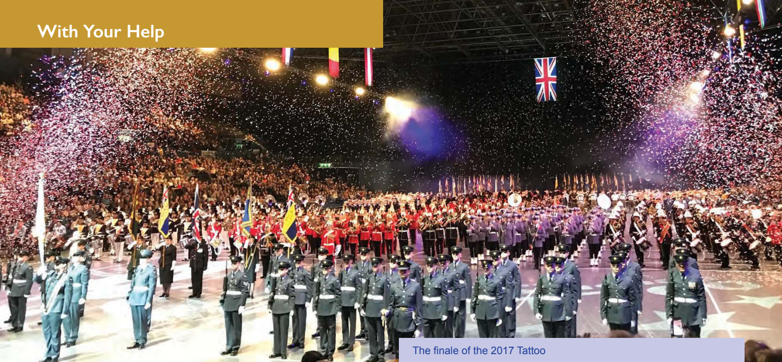
The finale of the 2017 Tattoo