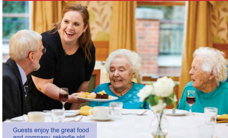
Guests enjoy the great food and company, rekindle old talents or learn new skills

We are delighted to hear that Solihull are trialling a new day care service in the community and that access to a dedicated activities room has made the trial possible. I wish the Star & Garter Club every success. We are delighted to see our grant reaching even more veterans.